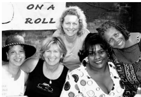
Attendees from Women On A Roll enjoy an "Afternoon Delight" at ONE.