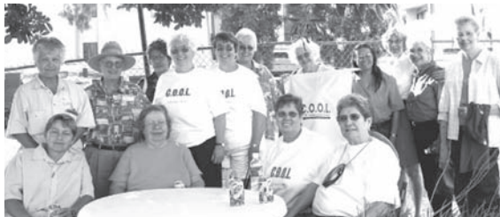
Last year—Attendees from COOL, the Coalition of Older Lesbians enjoyed Afternoon Delight 2004.

Inside, there will be a performance space for music, poetry, and more, offered by members of our diverse women's community. Community members that have