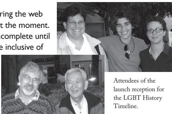
Attendees of the launch reception for the LGBT History Timeline.

ONE Archives is considering the web site a work-in-progress at the moment. "We are considering it incomplete until it grows to become more inclusive of the many diverse voices from throughout our community," said Hawkins. "We will, over the course of the next few months, be