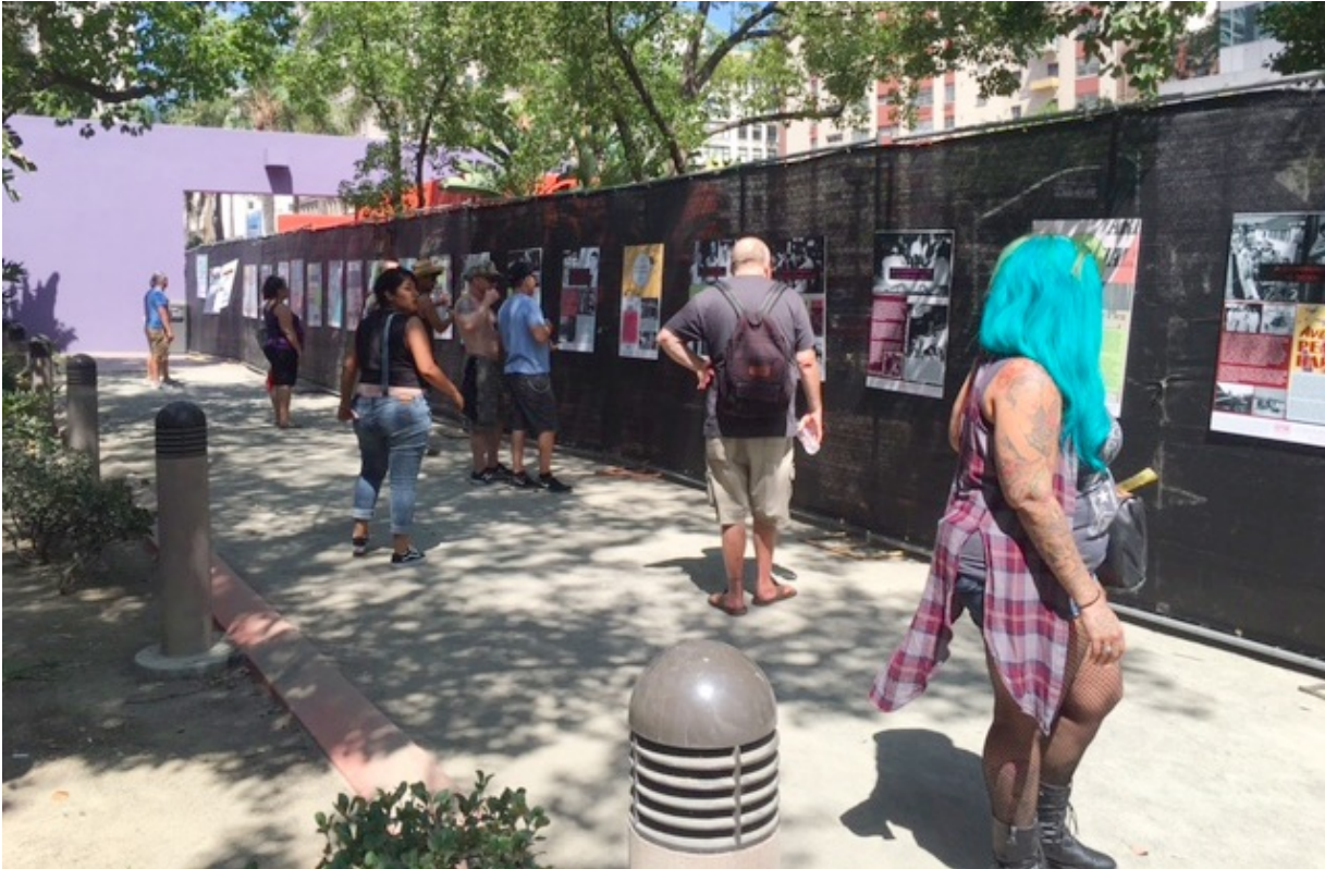
Image of attendees at the DTLA Proud Festival viewing the ONE Archives Foundation LGBTQ History Panels .